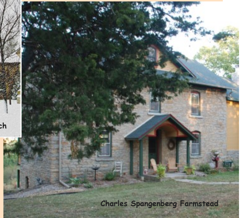
Charles Spangenberg Farmstead

Discover and learn about Woodbury's rich history from the Ice Age through the reign of Chief Little Crow to the arrival of the Europeans. Twelve notable sites will be open from 1 to 4 p.m. on Sunday, September 24. The Woodbury Heritage Society is making this possible in observance of Woodbury's Golden Anniversary as a City. Pick up your Passports and itinerary at the Heritage House (corner of Radio Drive and Lake Road). Tours are self-guided - stop at as many as time allows. Be sure to have your passport stamped at each site. Make your last stop "Passport Control" at Miller Barn and enjoy Passport Rewards including ice cream, cake, beverages and valuable coupons. There's a special prize for families with more than six stamped Passport sites!